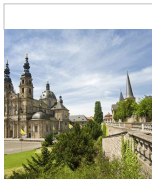
Dom and Michaelskirche

The city of Fulda on the banks of the Fulda River is the upper centre of the Eastern Hesse region and the ninth largest city of Hesse. It is the administrative seat of the Fulda rural district and at the same time one of seven Hessian cities with a special status. Fulda is the largest city of the Eastern Hesse region and its political and cultural centre. Fulda was also the seat of the Fulda monastery and is a university city, city of baroque, episcopal city with the bishop's seat of the Fulda bishopric. The landmark of the city is its cathedral St. Salvator.